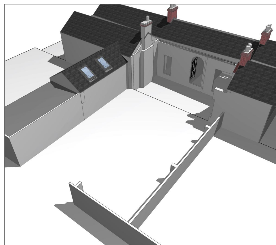
3 AFTER DEMOLITIONS