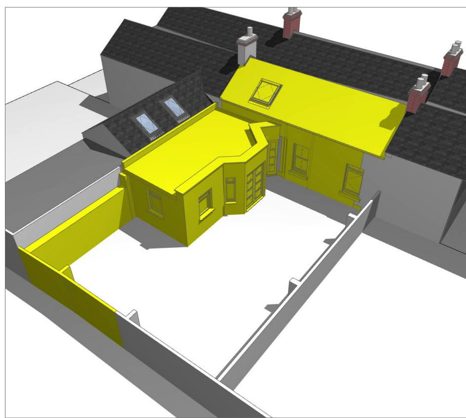
2 DEMOLITION ELEMENTS (SHADED YELLOW)