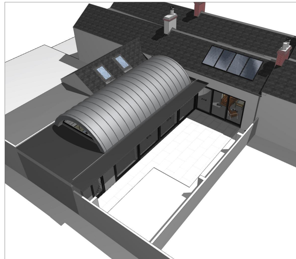
6 AERIAL VIEW - AS PROPOSED