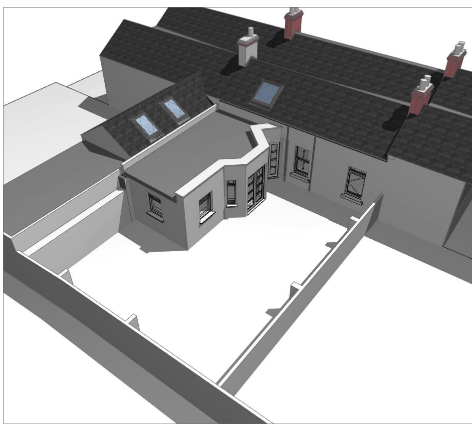
1 AERIAL VIEW - AS EXISTING